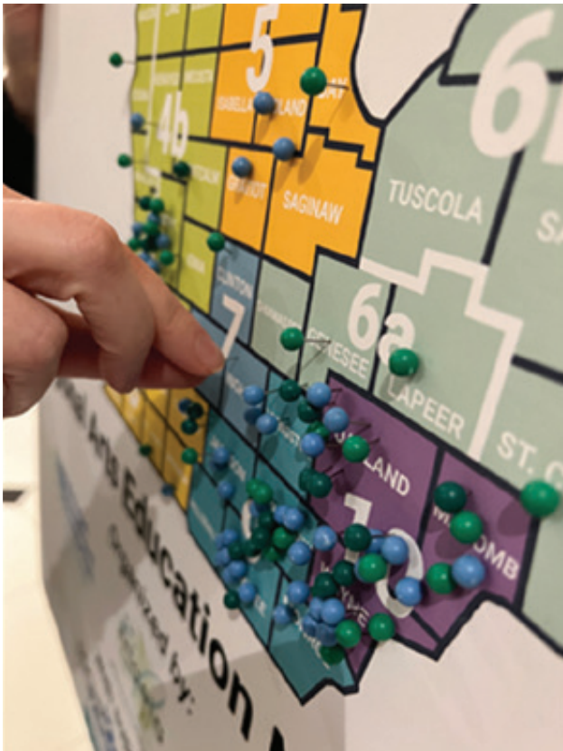
MAEIA Annual Conference attendee places their pin in their Regional Arts Ed Network

Together, the MACC and MAEIA Representatives offered professional learning to K-12 arts educators in their areas. The sessions featured information on MACC grant opportunities, the grant process, and deadlines. MAEIA professional learning reached 611 participants, continuing to feature implementation of MAEIA resources while introducing the Regional Arts Education Networks, and advancing the embodied practices of SEL and culturally responsible teaching in and through the arts.